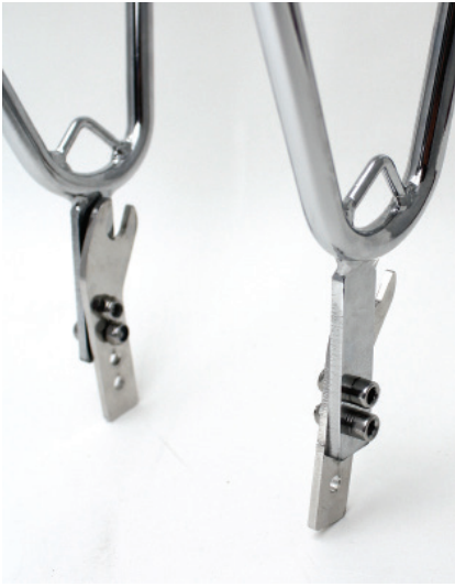
FIGURE 5: When mounting to fork eyelets you could turn the axle plates upside down. For smaller wheels, you could just skip using the axle plates.