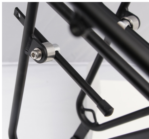
FIGURE 3: Midfork stays

Then attach the tang to the rack using the M4x 5mm screws and washers (E). Three are included. For safety use at least 2.